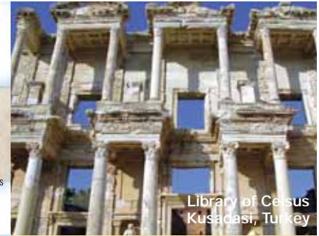
Library of Celsus Kusadasi, Turkey